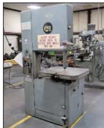
24" Grob Model NS24 Vertical Band Saw