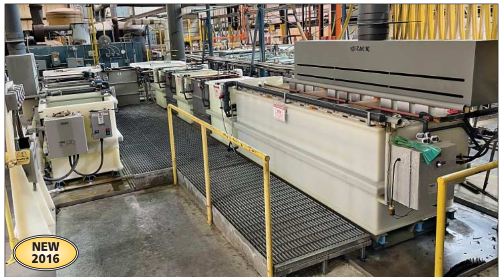
12 Tank Technic Manual Anodizing Line

6-Station Dan Technology Machine Type Rotary Table 6 Station + 4 Internal Unit + 1 External Unit Automated Polishing & Grinding Machine; S/N 6996 (2009)