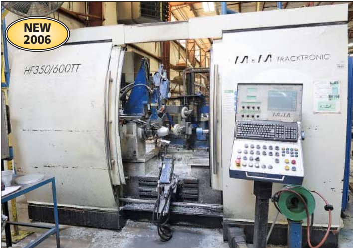
45.28" x 47.24" M&M Model HF350/600ATT Tracktronic CNC Metal Spinning Machine