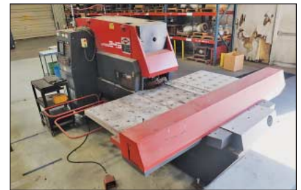
20 Ton Amada Aries 245 Turret Punch Press

1-1/2 HP Ex-Cell-O Style No. 602 Vertical Milling Machine; S/N 6023986, w/ Mitutoyo Digimatic DRO Display, Servo Type 140 Power Table Attachment, 100 - 3,800 Spindle RPM, 9" x 48" T-Slotted Table