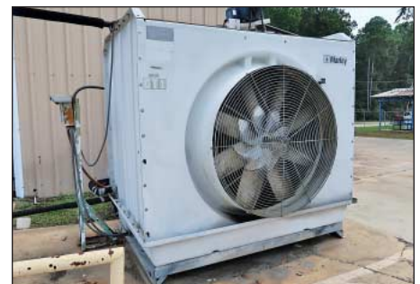
(2) Marley Aquatower Cooling Towers