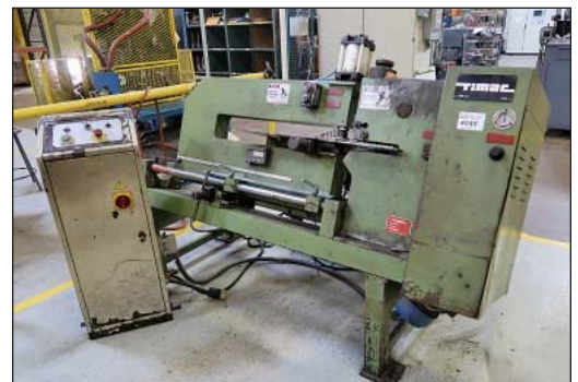
Timac Model TCDS 310 Circle Shear