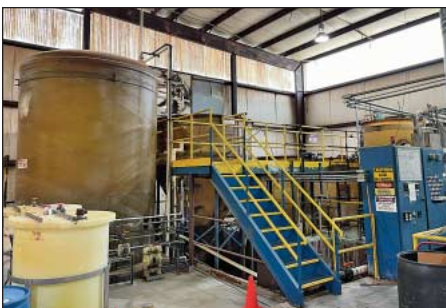
Walgren Co. Waste Treatment System