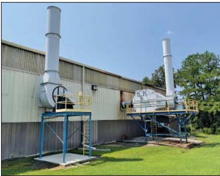
Viron Air Scrubber and Tri-Mer Blower Fan