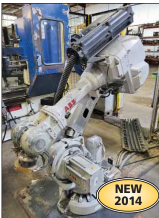
(2) ABB Type IRB4600-M2004 & IRC5-M2004 6-Axis CNC Robots