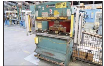
25 Ton x 47.3" Amada RG-25 Press Brake