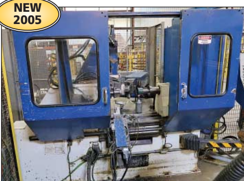
(1 of 5) 25.59" x 27.55" M&M Model TT 350 Tracktronic CNC Metal Spinning Machines