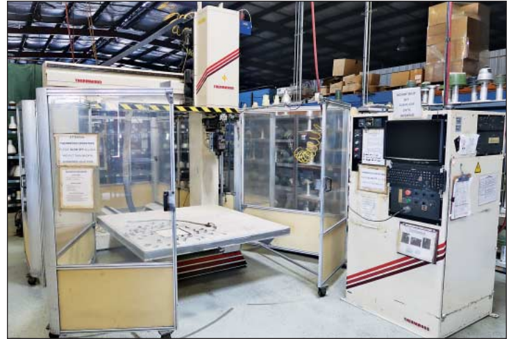
Thermwood Model C67 2-Head 5-Axis CNC Router

6-Station Mapos Italiana Automated Polishing System; S/N 2148.99 (1999)