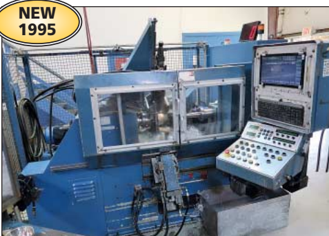
(1 of 5) 25.59" x 27.55" M&M Model TT 350 Tracktronic CNC Metal Spinning Machines