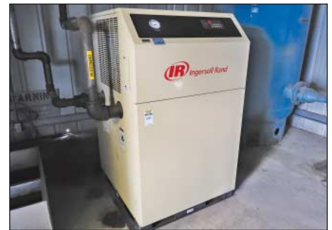
Ingersoll Rand Model D8501NA400 Refrigerated Air Dryer