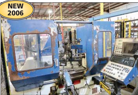
(1 of 5) 25.59" x 27.55" M&M Model TT 350 Tracktronic CNC Metal Spinning Machines