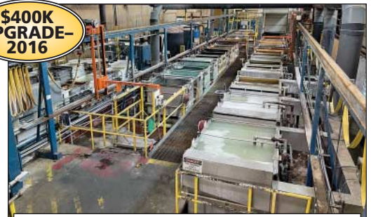
State of the Art Automated Anodizing Line