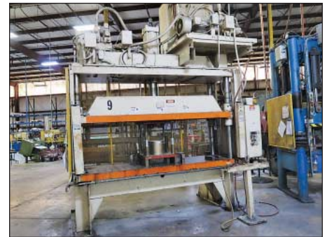
50 Ton Logan 4-Post Hydraulic Press

80 Ton Komatsu Model OBS 80-5 Gap Frame Mechanical Press; S/N 12530 (1989), 60-120 SPM, 3.94" Stroke, 13.78" Die Height, 3.15 Slide Adjustment, 21.65" L-R x 17.72" F-B Slide Dimensions, 39.37" L-R x 23.62" F-B x 5.51" Thickness Bolster Dimensions, with Light Curtains, 20" PA Industries Advantage Servo Roll Feeder, 20" PA Industries Model 55-19-S Straightener, S/N 17063-1-57763, 20" PA Industries Coil Reel