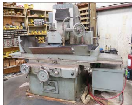
16" x 36" Gallmeyer & Livingston Model 570 Rotary Surface Grinder

Large Quantity of Inspection Equipment; Height Gauges, Micrometers, Indicator Stands, Granite Tables, Etc.