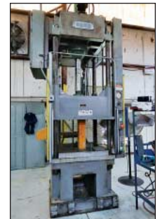
75 Ton Dake Model 27-597 Guided Platen Hydraulic Press