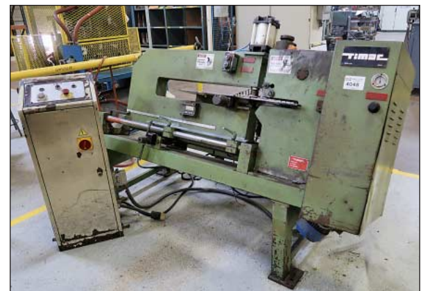
Timac Model TCDS 310 Circle Shear