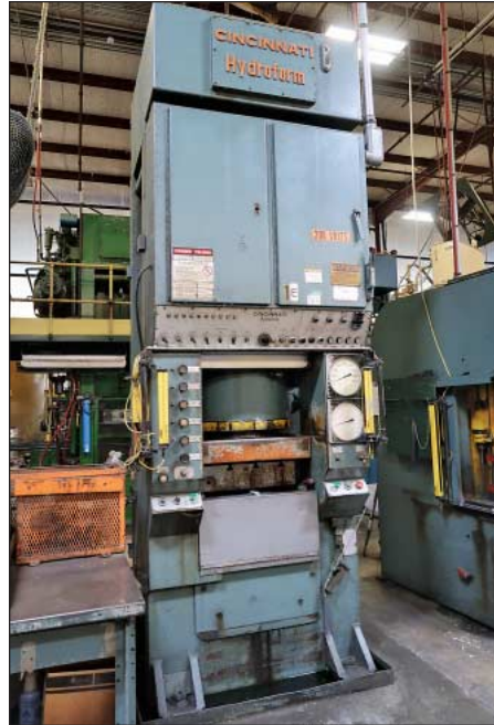
368 Ton Cincinnati Model 20-6-7 Hydroform Press