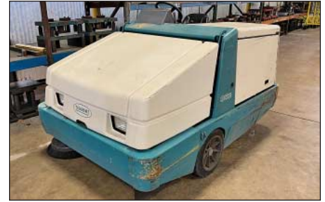
Tennant 355 LP Gas Sit Down Floor Sweeper