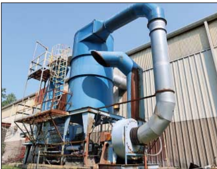
SLY Model Venturi #8 Dust Collection System