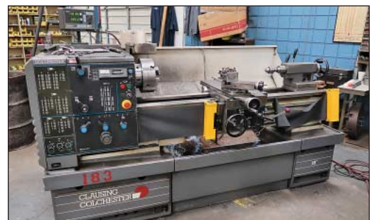
15" x 50" Clausing Colchester Model 15 Geared Head Engine Lathe