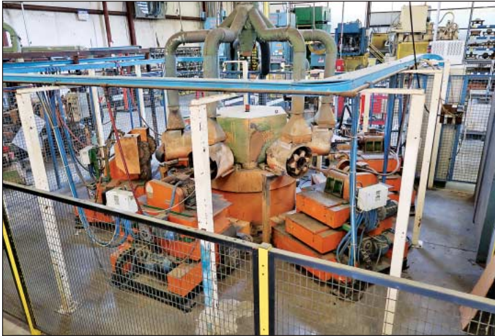
6-Station Dan Technology Machine Type Rotary Table 6 Station + 4 Internal Unit + 1 External Unit Automated Polishing & Grinding Machine