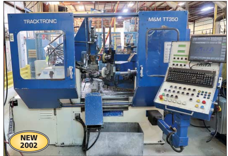
(1 of 5) 25.59" x 27.55" M&M Model TT 350 Tracktronic CNC Metal Spinning Machines