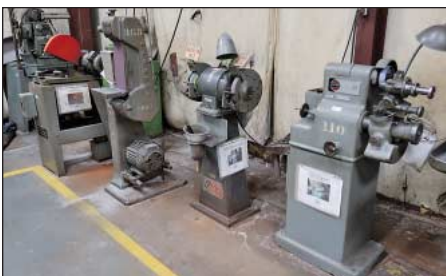
Large Quantity Miscellaneous Toolroom Machinery