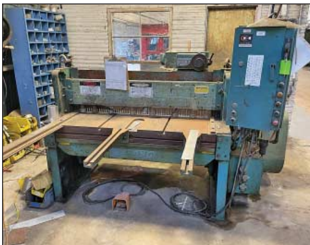
52" x 12 Ga. Wysong Model 1252 Power Squaring Shear