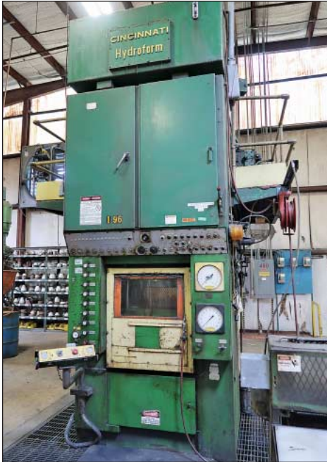
634 Ton Cincinnati Model 25-6-10 Hydroform Press