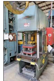
50 Ton Multipress Model FN50-30H C-592E SO.99270-C Gap Frame Hydraulic Press