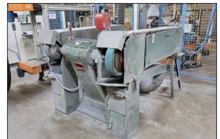
HD EMD Hammond Buffer