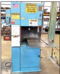
20" DoAll Model 2013-V Vertical Band Saw