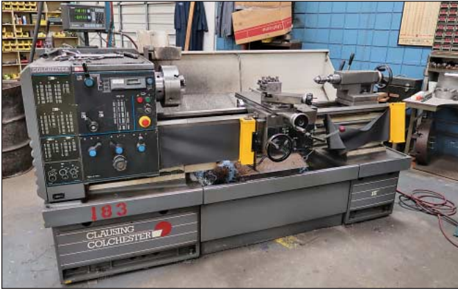
15" x 50" Clausing Colchester Model 15 Geared Head Engine Lathe