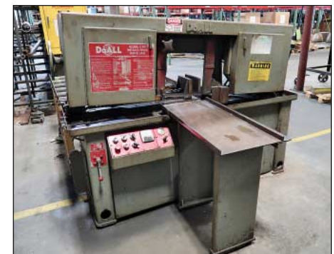
12" DoAll C-9V Horizontal Band Saw