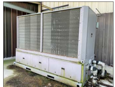
22 Ton Carrier Model 30RAN022B-611AB Chiller