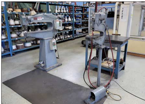
Libert 430 Circle Shear & Misc. Pneumatic Punches