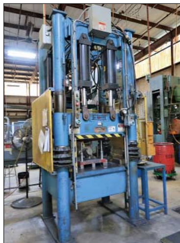
150 Ton Beckwood 4-Post Hydraulic Forming Press