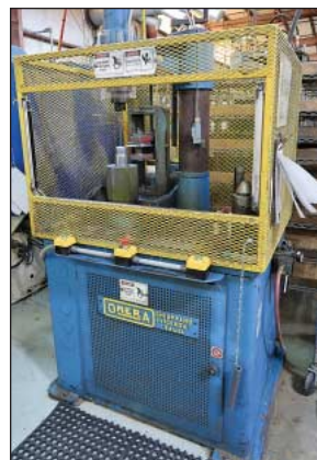
(1 of 3) Omera R2/4 Trimming/Beading Machines