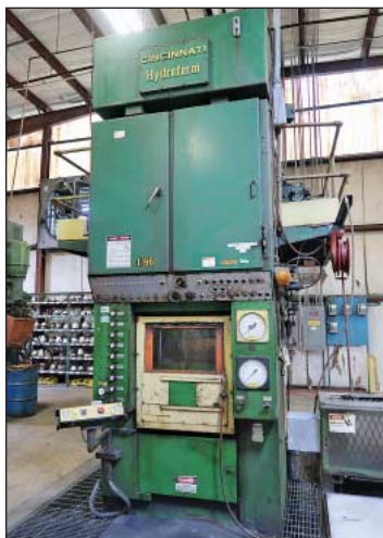
634 Ton Cincinnati Model 25-6-10 Hydroform Press State of the Art Automated Anodizing Line