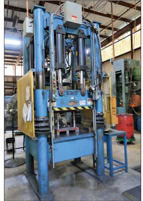
150 Ton Beckwood 4-Post Hydraulic Forming Press

368 Ton Cincinnati Model 15-10-7 Hydroform Press; S/N 68-300-F-841-1, 15" Max Blank Diameter, 7" Draw, 12" Punch Dia., 9 Ton Punch Strip, 10,000 PSI, 26" L-R x 30" F-B (Out of Service)