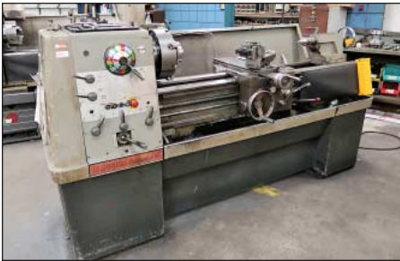
15" x 50" Clausing Colchester Model 15 Geared Head Engine Lathe