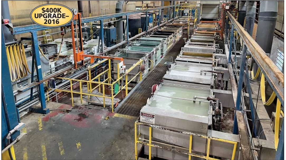
37-Tank State of the Art Automated Anodizing Line with RO Systems, Rectifiers, Steam Boiler & More