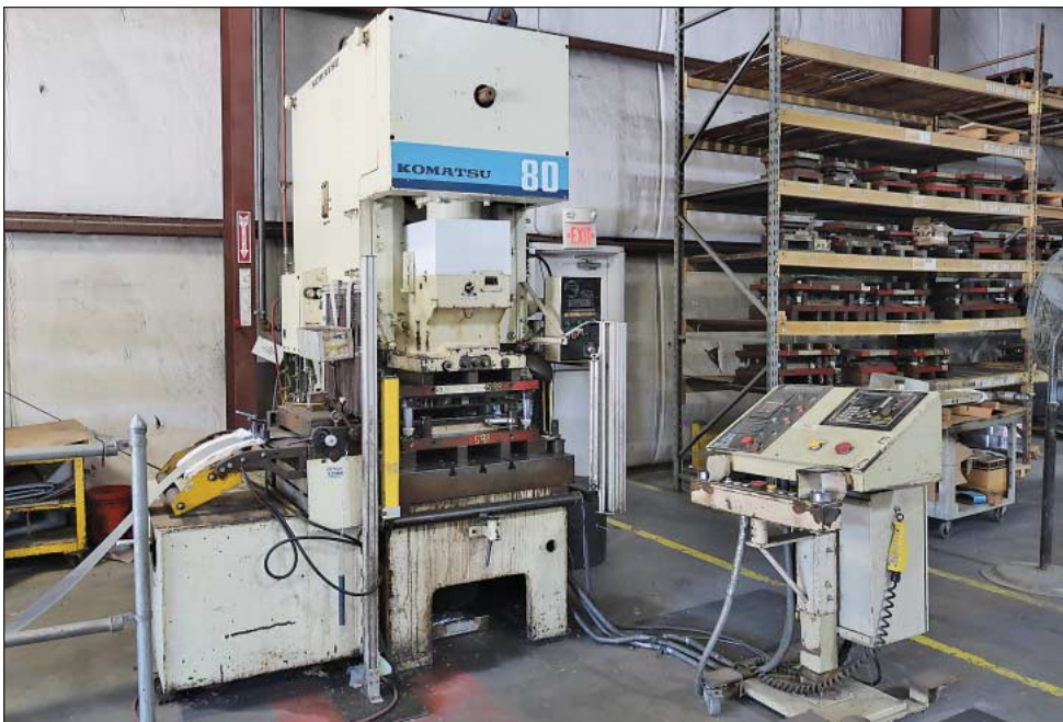
80 Ton Komatsu Model OBS 80-5 Gap Frame Mechanical Press