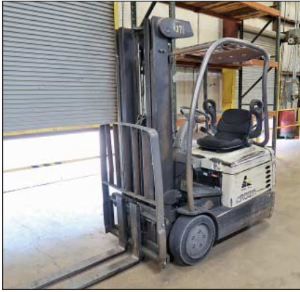
(2) 3,000 LB Crown SC-4010-30TT190 Sit Down Electric Lift Truck

SALE DATE: THURSDAY OCTOBER 14TH STARTING AT 9:00 AM CT