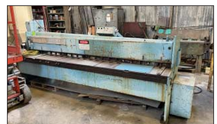
10' x 10 Ga. Niagara Model IR-10 Power Squaring Shear