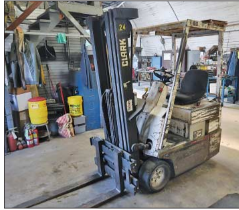
(2) 3,000 LB Clark TM15S Sit Down Electric 3-Wheel Lift Trucks