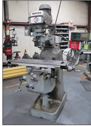
3 HP Hurco Model SM1 Vertical Milling Machine