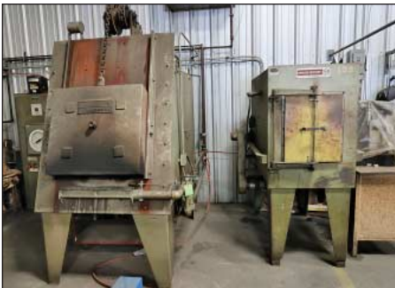
(2) Lindberg Electric Furnaces