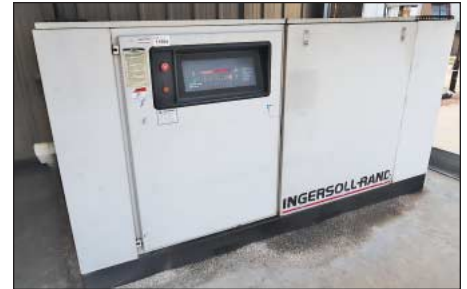
75 HP Ingersoll Rand Model SSR-EP75 Rotary Screw Air Compressor

Large Quantity of Misc. Shop Equipment: Carts, Pallet Jacks, Mag Blocks, Drum Dollies, Shelving, Die Carts, Metro Carts, Ladders, Fans, Large Ceiling Fans, Maintenance & MRO Items, Spare Motors, Racking, Steel Inventory, Flammable Cabinets, Wire Baskets, (2) 2,000 Lb. Bux Model CM-3 Magnetic Toter, Shop Vac's, Die Lift Carts, (6) 48" x 97" x 36-1/2" High x 3/8" Thick Steel Top Plate Welded Frame Tables