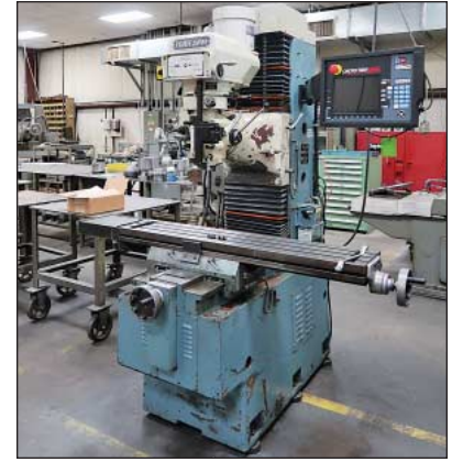
3 HP SWI Model Trak DPM CNC Vertical Milling Machine